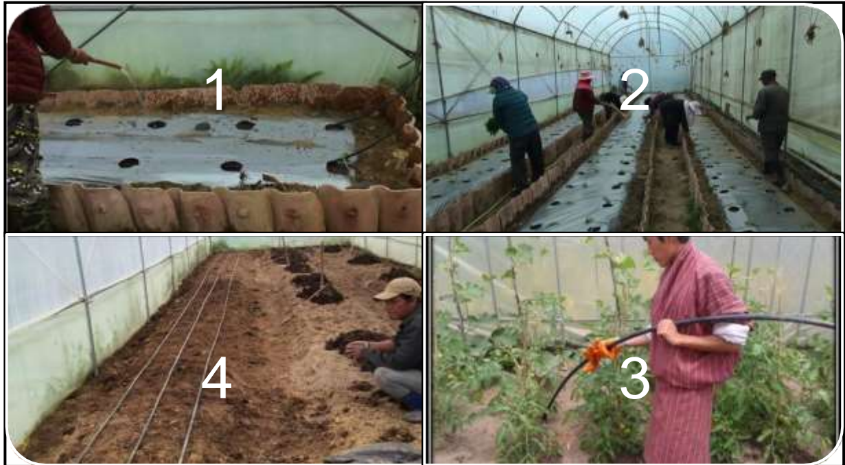
1. Irrigation before transplanting 2. Transplanting 3. Irrigate on roots 4. Drip irrigation