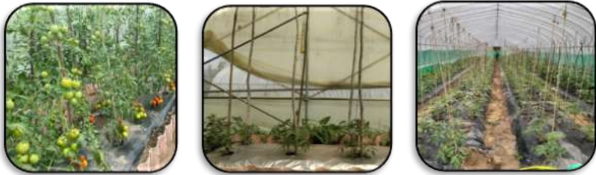
Figure 4. Staking of tomato (Centre-Right stage of staking, right-Haywire staking)