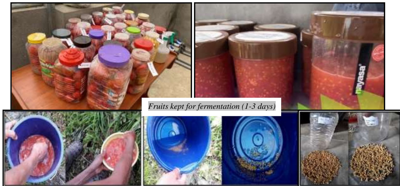
Figure 9. Tomato seed extraction by removing pulp

seeds get separated from the pulp and settle down at the bottom of the bucket. The floating fraction is removed. The settled seeds should be washed with water for three to four times. The washed seeds are dried in a partial sun light.