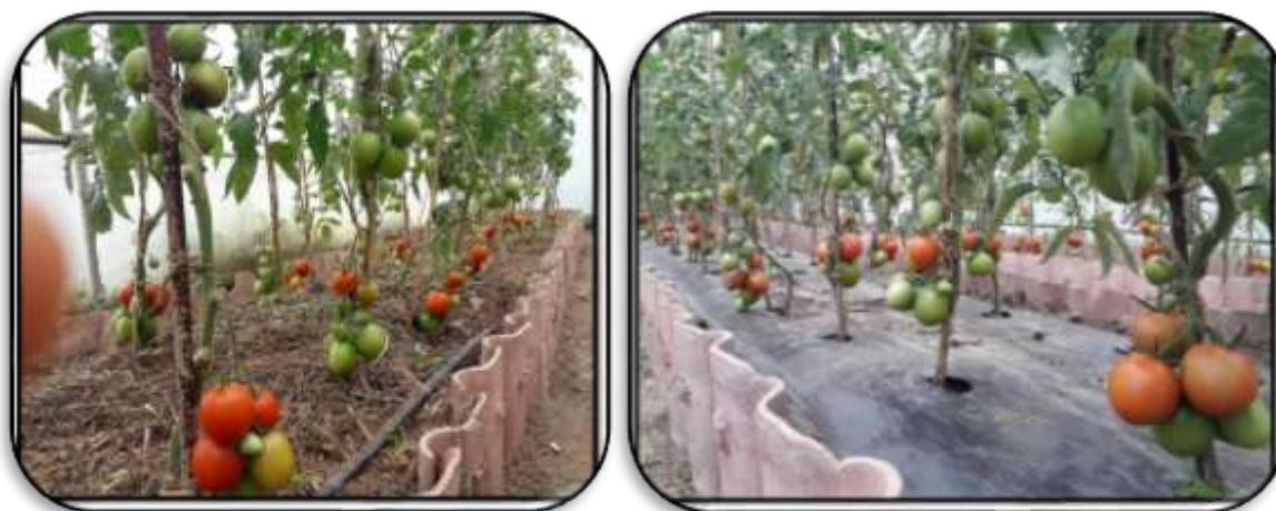
Artemisia leaf mulch

The use of black plastic mulch is also becoming increasingly popular.