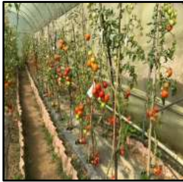
d. Tomatoes under fabricated polyhouse