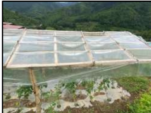
e. Tomatoes under low-cost bamboo polyhouse (With roof covering)