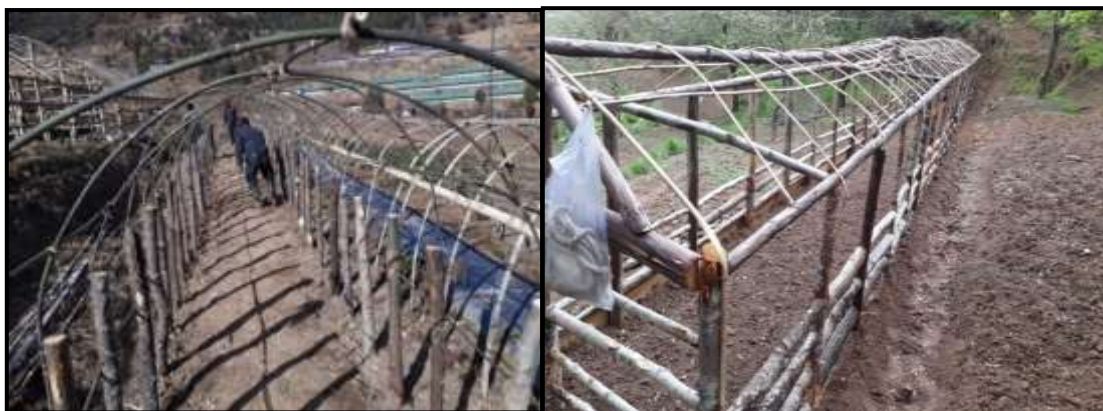
Low cost domed rain shelter can be made with wooden poles and battens (low-cost installation in farmer's field)