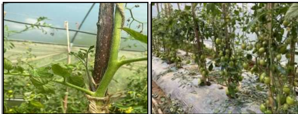
Figure 5. Pruning tips for tomato

Prune off dead, dry and diseased leaf at the base