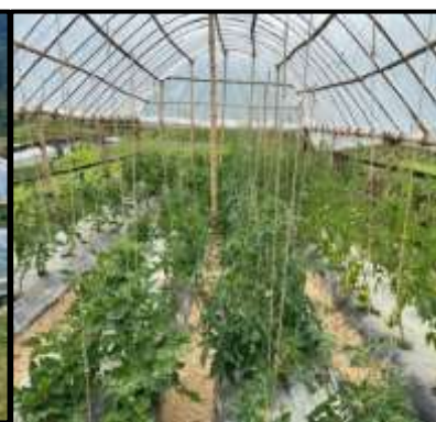
c. Low-cost Rain shelter (sloped roof)