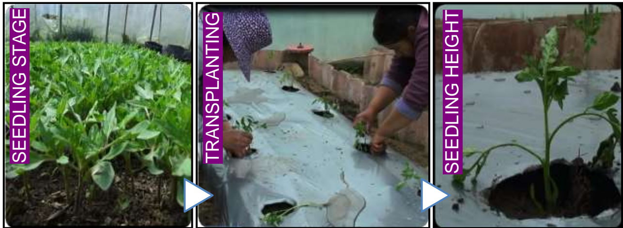
Figure 2. Transplanting technique

Tomato seedlings should be ready in a month after sowing. Transplant the seedlings on the raised beds with the row-to-row distance of 50-60 cm and plant to plant 40-50 cm. However, the spacing will also be determined by varieties. It is estimated that an acre of land can accommodate 40,000 seedlings. It is recommended to harden seedlings before transplanting which can be done by withholding irrigation intermittently. In the poly tunnel, nursery should not be covered by plastic or net 1-2 weeks before transplanting. Nursery trays should also be taken out and hardened outside before transplanting. Seedlings should be 12cm high or four-five leafed during transplanting. Transplant seedlings during evening hours and irrigate immediately.