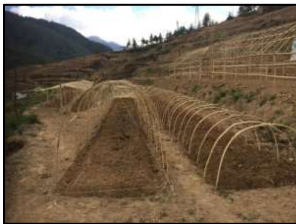
Figure 11. Tomato under different protected structures