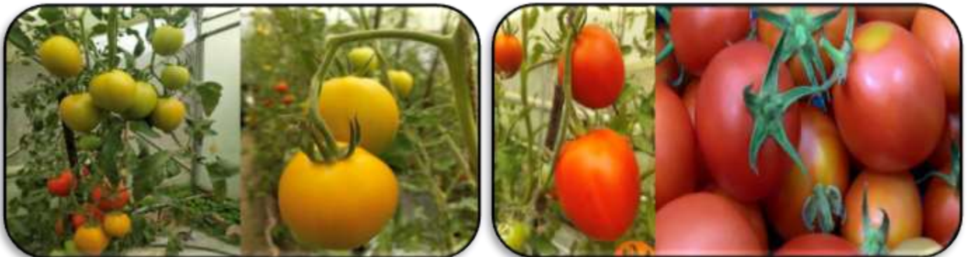
Tomato at mature green stage