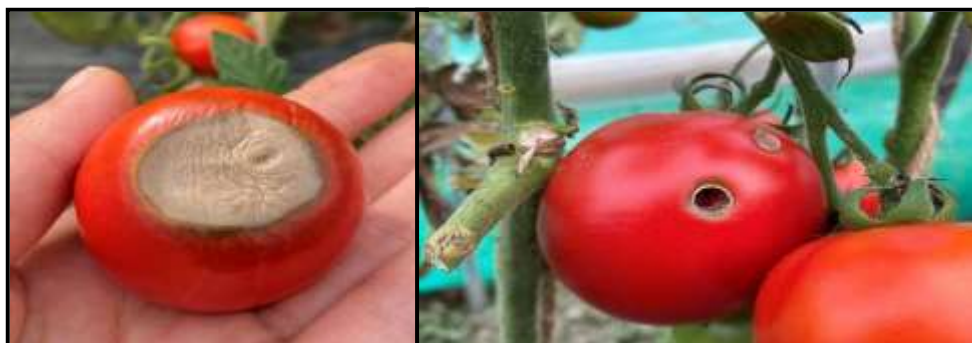
Blossom end rot

Spray Calcium Chloride @100g/21liters of water once a week for 6 weeks if there are symptoms.