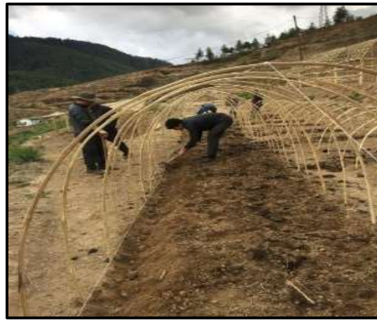
Figure 12. Construction of different low-cost structures