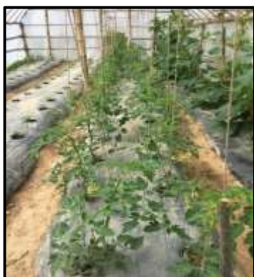
a. Polyhouse from bamboos (fully covered)