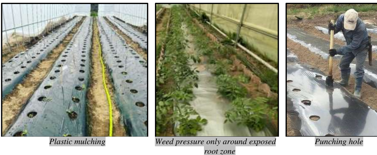
Figure 7. Punching of holes in plastic mulch

40cm-50cmPP on two rows. Holes can be punched by a simple tool of metallic can which is fixed in a 1m wooden pole. The can is heated and punched on the plastic after mulching the beds. Some farmers also use a fabricated tools with sharp edges to punch holes.