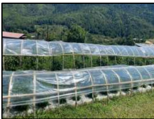
b. Low cost domed shaped polytunnel