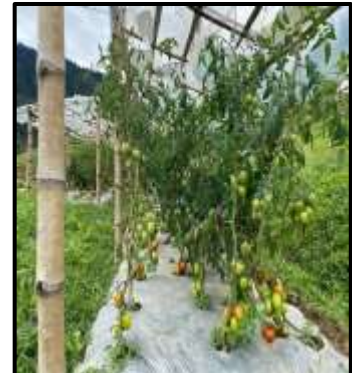
f. Production in bamboo rain shelter (sloped roof)