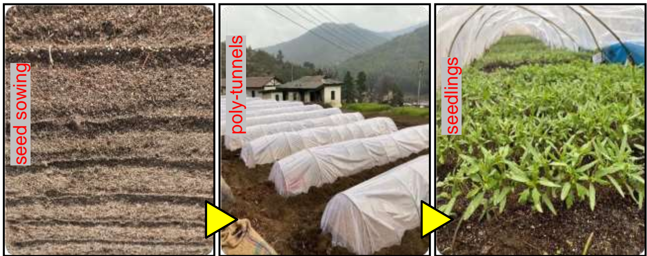
Figure.1. Nursery production technique

In the higher altitude areas above 1800masl, it is advisable to use poly-tunnel having semi-circular structure of bamboo sticks over the nursery bed. The plastic sheet is laid over the structure and the sides are covered with soil. Open the plastic during the day time and close it in the evening.