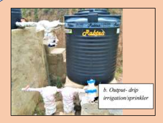
Fig 3: Outlet of Rangzhin Luechu from filtration tank

Start application after one month of sowing or transplanting. Apply once at the interval of 15 – 21 days